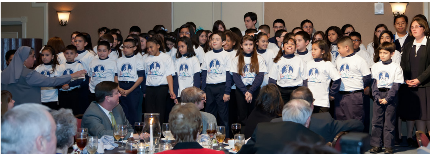
Children from FMA schools recite 25th anniversary prayer

The event was successful because it was the result of many hands and heart working together. All-inclusive gratitude and joyful unity strongly characterized the day and has also defined our province from its origin. In actuality the celebration continues as we grow as a province with our many collaborators and with the powerful help of Mary!