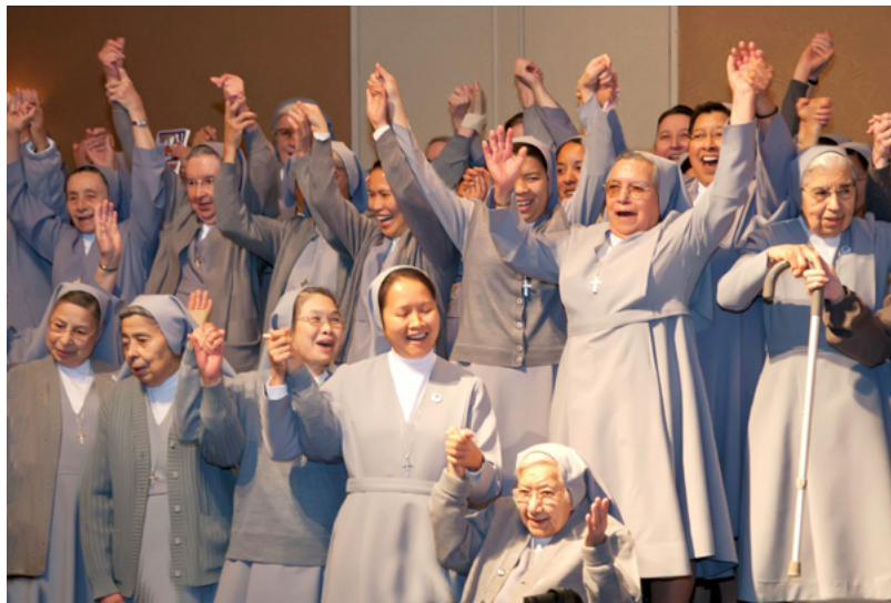
All the FMA, novices, postulants and candidates sing together "O Qual Sorte!" (What a joy it is to be an FMA!)