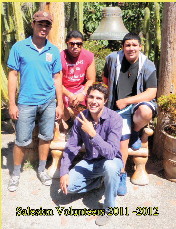
Salesian Volunteers 2011 -2012

We are looking for 8 young people who would like to serve God for one year as a Salesian Volunteer.