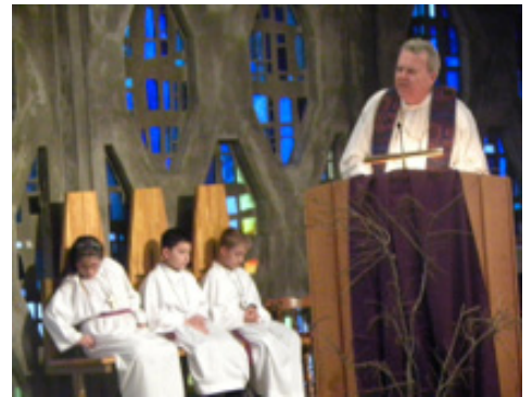
Luke’s Lenten Mission - February 25-29